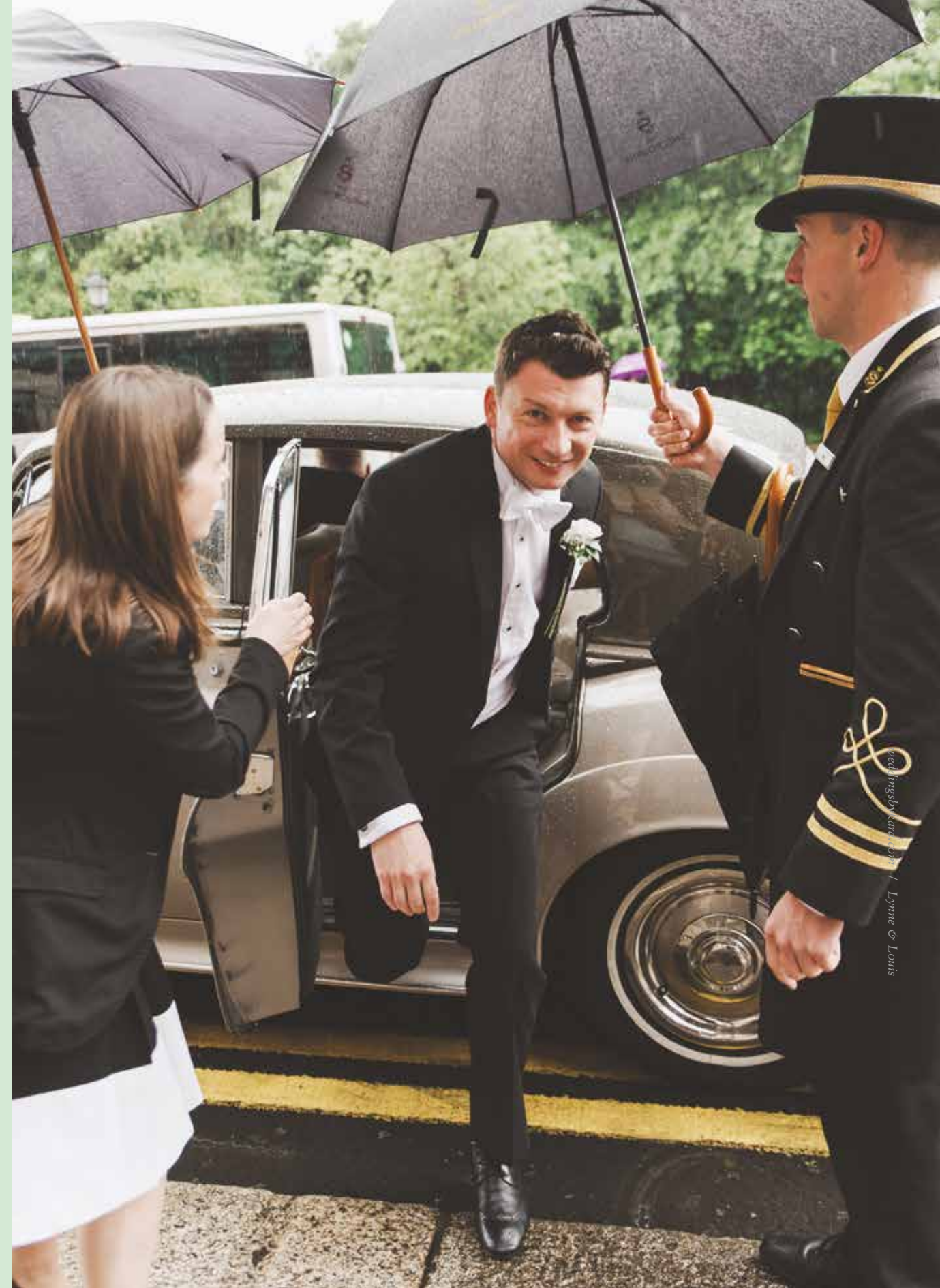
beddingsbykate.com / Lynne & Louis

Our Wedding Executive offers you another layer of comfort and reassurance. The morning of a wedding is an exciting, emotional and often very busy time. Our Wedding Executive is on hand to make sure it runs smoothly and beautifully. She understands your vision inside and out, and is your dedicated coordinator, so that you can completely relax and lose yourself in every perfect moment.