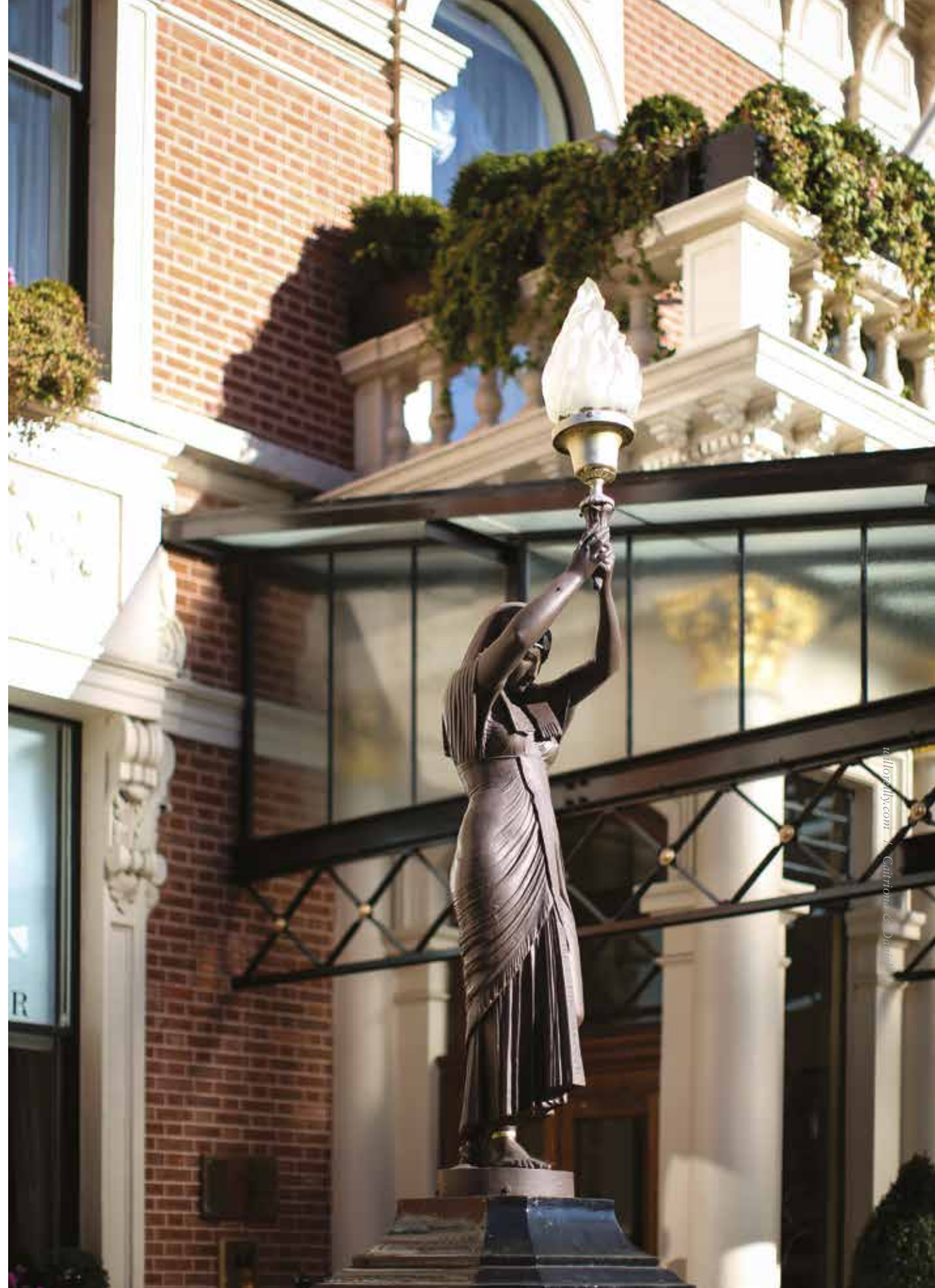
mallovally.com / Caitriona & Damien