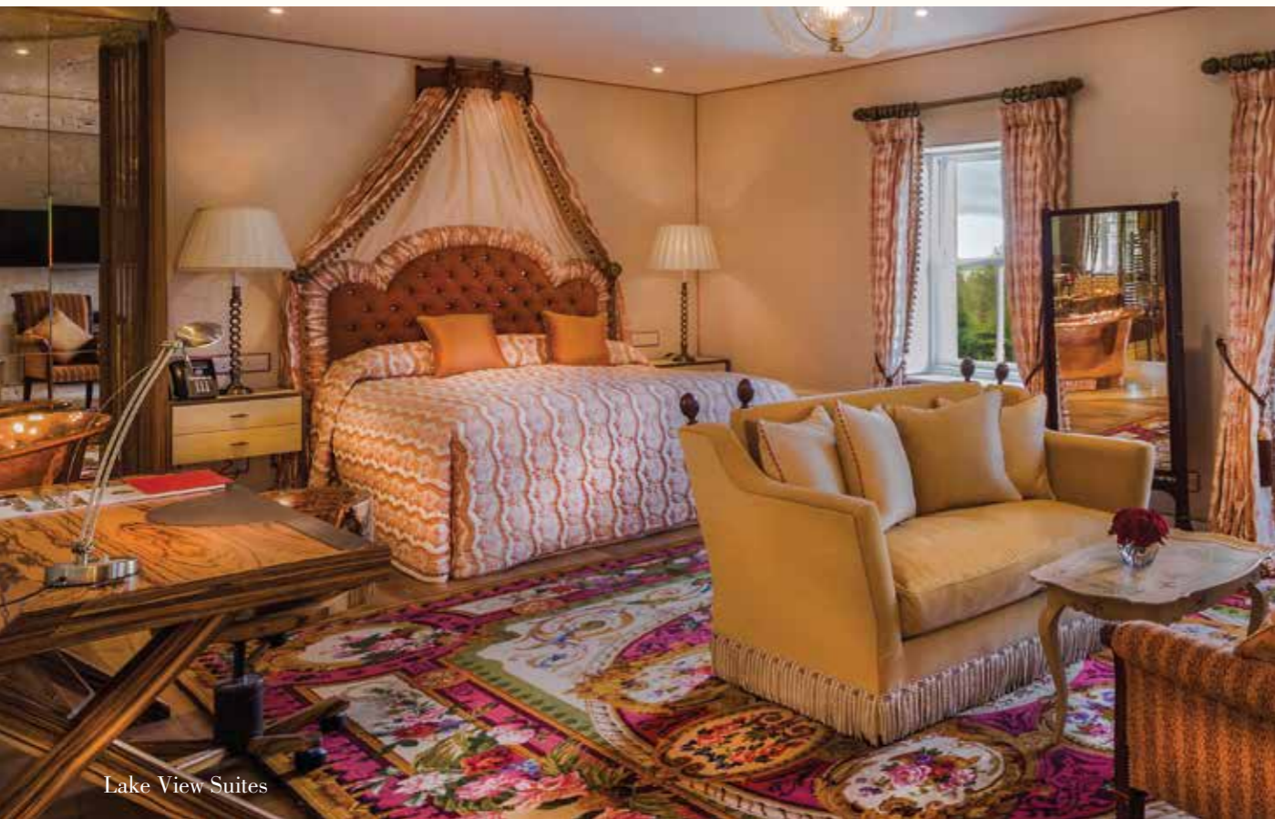
Lake View Suites

The Lake View Suites are the most magnificent rooms at The Lodge, offering sweeping views of Lough Corrib, many with a private terrace or balcony. Some rooms also feature gas fireplaces and in-room baths.