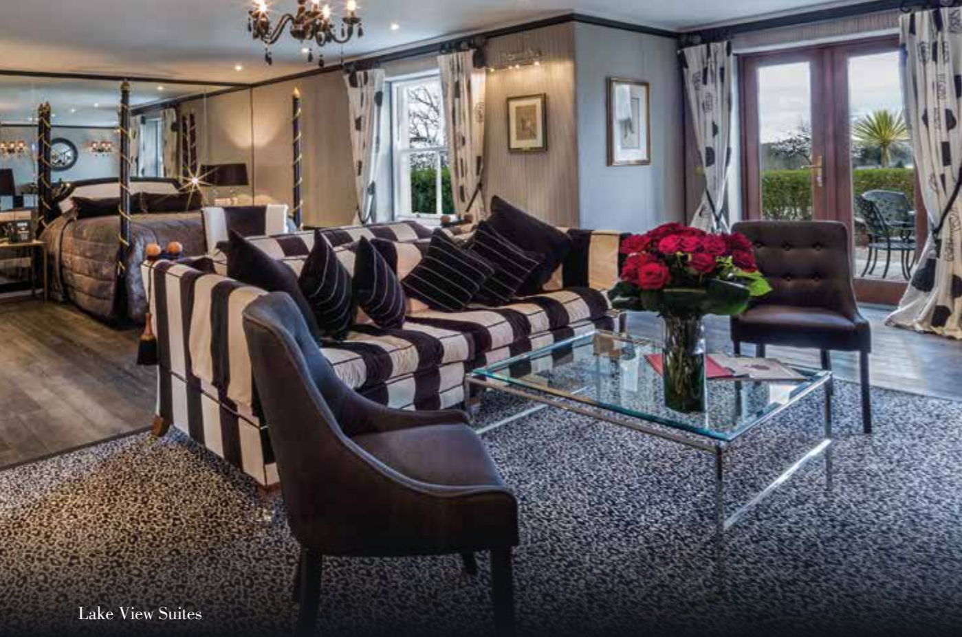
Lake View Suites